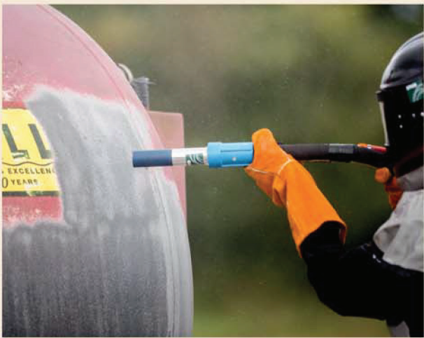
Attached to a blasting machine for restoring and refurbishing