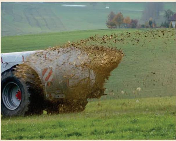
Fast & effective cleaning for slurry lines

From blowing-out the slurry line of an umbilical spreading system, to clearing organic debris from a combine harvester, baler or other agri-machinery, once you've mounted the Applied VariMount 350 PTO Compressor to the rear or front of your tractor, you'll discover its many and varied uses.