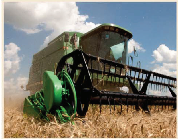
Use with a blow-down lance for powerful dry cleaning