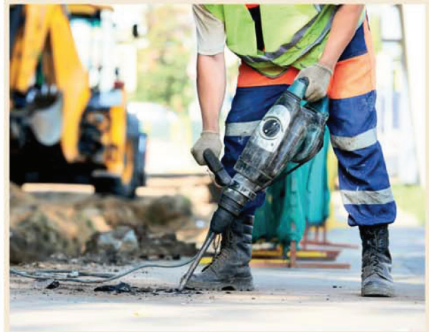
Attached to a kango hammer for removing concrete